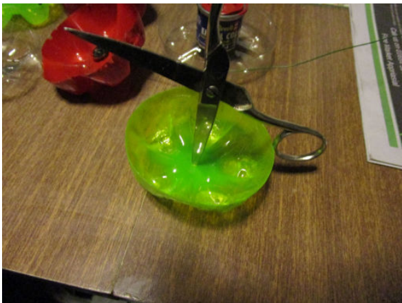
Make a small hole in the centre