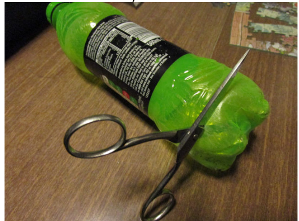
Cut the bottom off a small drinks bottle