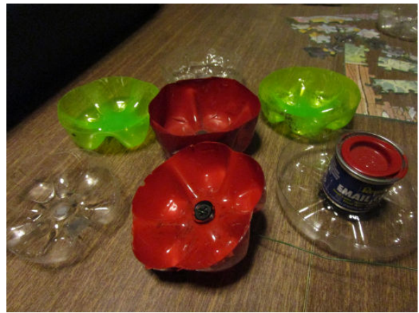
Paint flowers with Enamel paint. (Acrylic paint won't work.) Haywards have small pots which will paint quite a lot of flowers. A variety of colours would be good. The green ones pictured haven't been painted.